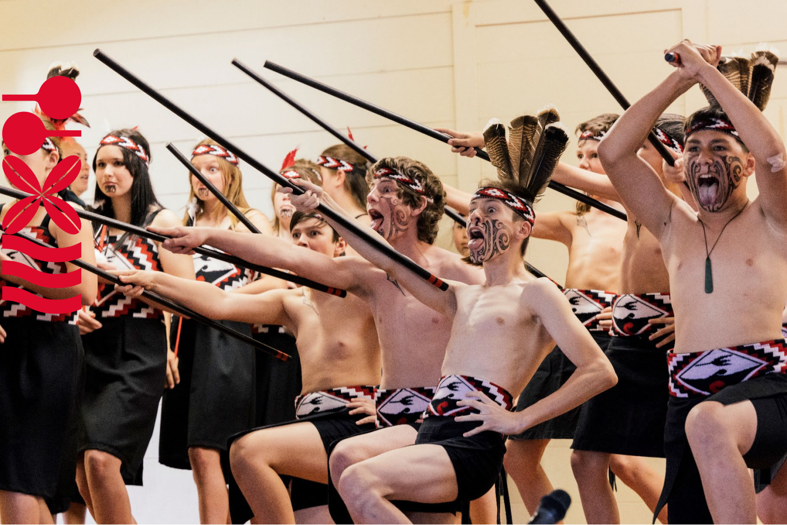
Kapa haka performance by Kaukapakapa School