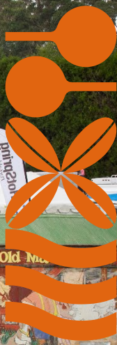
The Kumeū Show